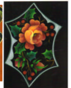
Cabbage Rose Saturday March