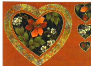
Tropical Flower Friday March 19