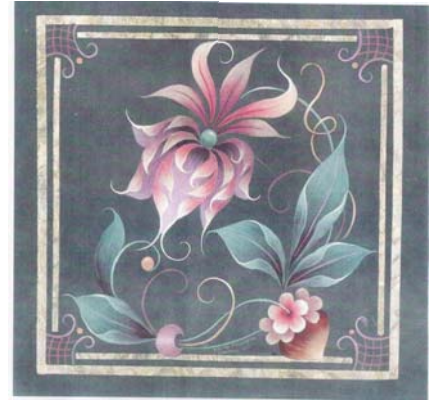
Jellyfish Tulip Sunday April 1